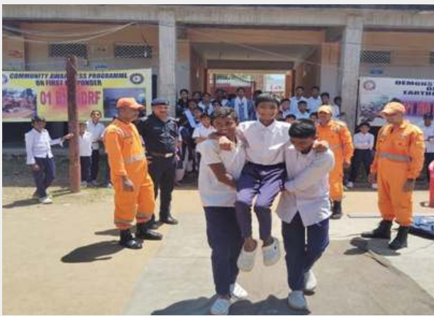
Dated: 30/08/2024, DNHS School, Udharbond

An awareness program was conducted at DNHS School under the Udharbond Revenue Circle, focusing on various types of disasters. Sessions were led by the 1st BN NDRF, who educated students on crucial actions to take before, during, and after natural disasters. The program emphasized proactive measures for community safety, including recognizing warning signs, understanding evacuation procedures, and adhering to safety protocols. Through interactive presentations and discussions, students acquired valuable skills to protect themselves and others during emergencies. The 1st BN NDRF facilitated an extensive exchange of information, fostering a culture of preparedness and resilience within the community.