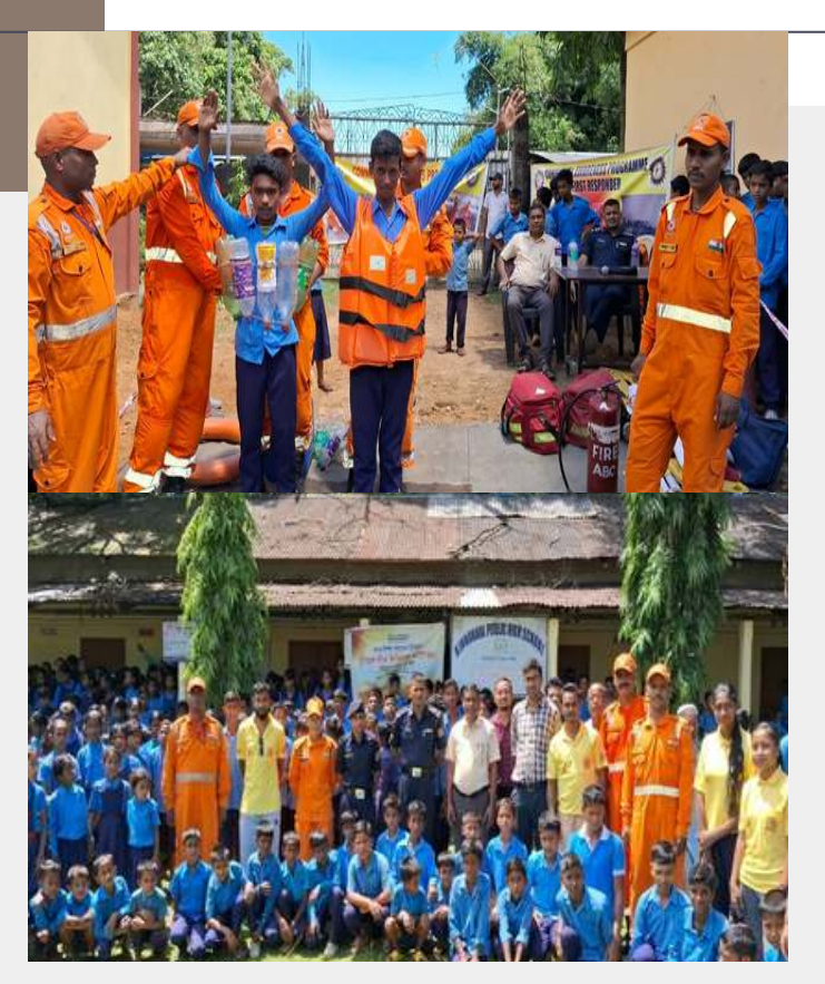
Dated: 03/09/2024, Kinnakhal Public High School, Katigorah

Awareness program was conducted at Kinnakhal Public High School under Katigorah Revenue Circle, focusing on various types of disasters and preparedness. Sessions were led by the 1st BN NDRF, who educated students on crucial actions to be taken before, during, and after any kind disasters. The program emphasized on proactive measures for community safety, including recognizing warning signs, understanding evacuation procedures, and adhering to safety protocols. Through interactive presentations and discussions, students acquired valuable skills to protect themselves and others during emergencies. The 1st BN NDRF along with CQRT volunteers facilitated an extensive exchange of information, fostering a culture of preparedness and resilience within the community.