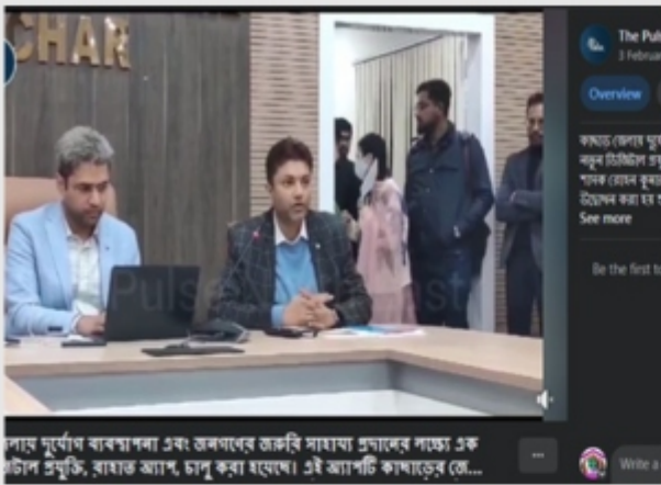
স্বয়ংক্রিয় ব্যবস্থাপনা এবং জনগণের জরুরি সাহায্য প্রদানের ক্ষেত্রে এক ডিজিটাল ইন্টারফেস, 'রাহাত অ্যাপ', চালু করা হয়েছে। এই অ্যাপটি কাছাড়ের জেলা...