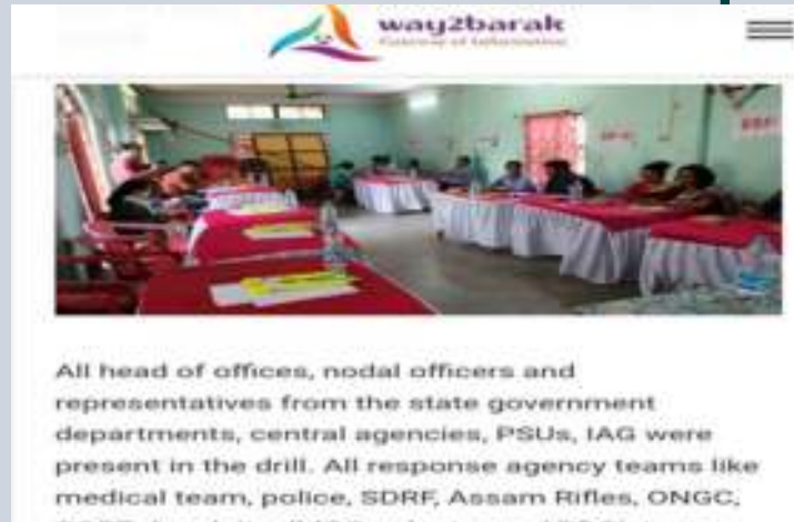
All head of offices, nodal officers and representatives from the state government departments, central agencies, PSUs, IAG were present in the drill. All response agency teams like medical team, police, SDRF, Assam Rifles, ONGC,