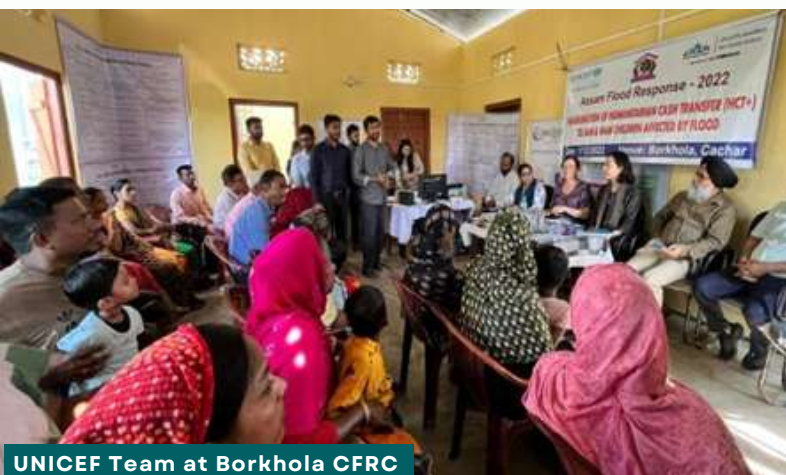
UNICEF Team at Borkhola CFRC