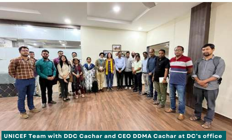
UNICEF Team with DDC Cachar and CEO DDMA Cachar at DC's office

A debriefing meeting was held in the O/O the D.C. Cachar in the presence of DDC, Cachar, and CEO, DDMA, Cachar where the future course of action and support initiatives of DDMA Cachar in joint collaboration with UNICEF was discussed and minuted.