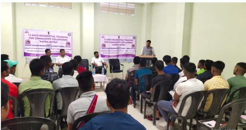
On October 29th Inauguration of AAPDA MITRA Training for the 3rd batch of Hailakandi District volunteers at Boscotech Institute, Silchar. Training conducted by a team of experts, organized by DDMA Cachar in collaboration with ASDMA and NDMA.

"Empowering volunteers, igniting hope, and building a resilient community together."