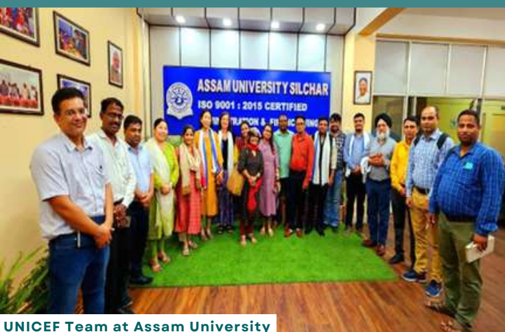
UNICEF Team at Assam University

The team also interacted with resource persons and NSS volunteers from Assam University also shared their experience on volunteerism in the context of the Cachar floods in 2022 and committed to future collaborations and support in strengthening DRR initiatives like CFRC and IAG.