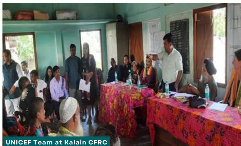
UNICEF Team at Kalain CFRC