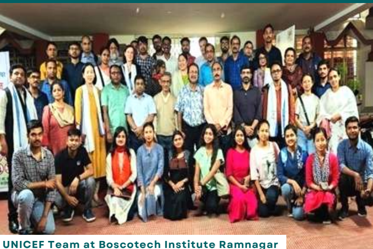
UNICEF Team at Boscotech Institute Ramnagar

UNICEF India Team visited Cachar on 30th November'22 and 1st December 22.