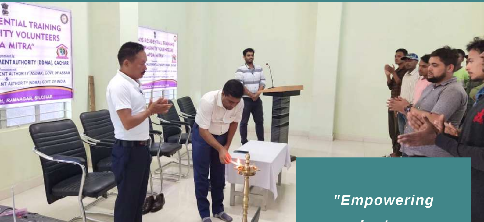
Official inauguration of AAPDA MITRA Training of 2nd batch volunteers of Karimganj District

"Empowering volunteers, igniting hope, and building a resilient community together."