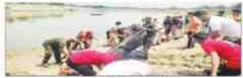
শিলচর জেলায় বন্যা নিয়ন্ত্রণের কাজে অগ্রগতি।

শিলচর: বন্যায় ক্ষতিগ্রস্ত শিলচর জেলায় গত এক মাসে বন্যা নিয়ন্ত্রণের কাজ ধীর গতিতে চলছে। জেলা প্রশাসনের সূচনা করা হয়েছে।