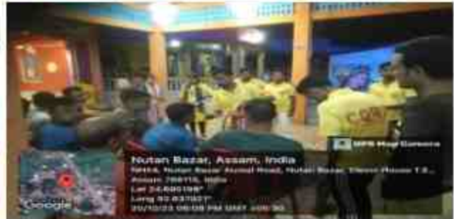
14. Dated 21.10.2023 2nd day training of Durga Puja Organizing Committee members organised by Circle Disaster Management Committee, Sonai Revenue Circle on handling of fire extinguisher, providing first aid, making of improvised stretcher etc