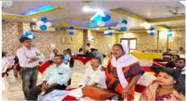
13. Dated 20.10.2023 In view of Durga Puja, 23 Circle Disaster Management Committee, Sonai Revenue Circle conducted training program for different Durga Puja Organizing Committee members by involving CQRT on handling of fire extinguisher, providing first aid, making of improvised stretcher etc.