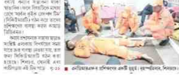
দুৰ্যোগ মোকাবিলায় কুইক ৰেসপন্স টিমকে প্রশিক্ষণ এনডিআৰএফেৰ কৰা হৈছে।