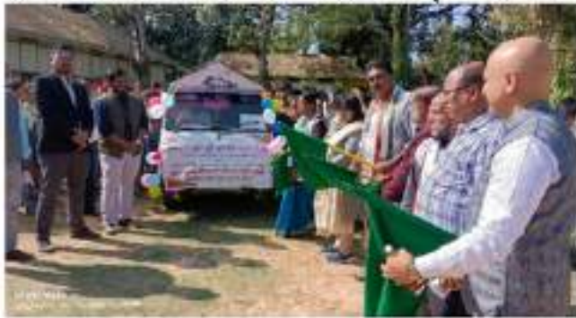
দুৰ্যোগে তাৎক্ষণিক কীভাবে মোকাবিলা

দুৰ্যোগে তাৎক্ষণিক কীভাবে মোকাবিলা, ব্যাখ্যা কর্তৃপক্ষের।